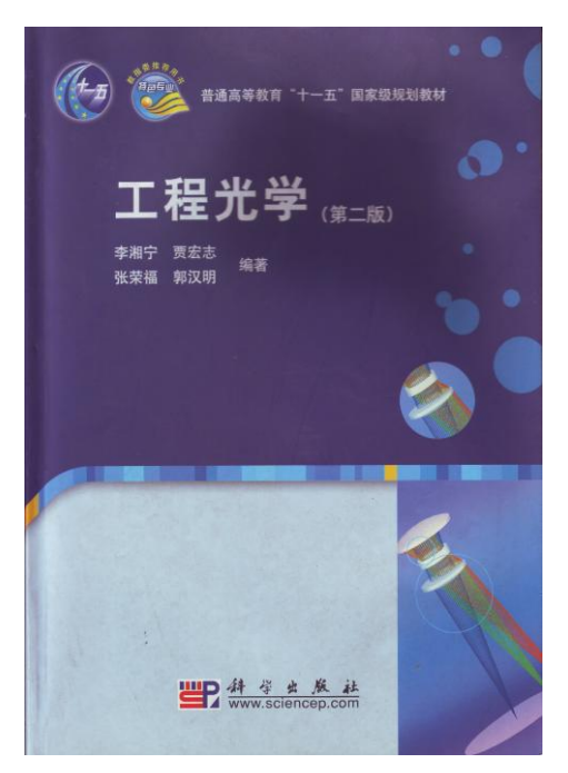
Top quality Course of Shanghai "Optical electronics "